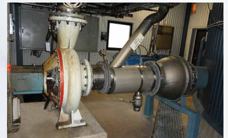
Pump installation situation at Skutskär plant

Medium: Pulp with black liquor Pump: Sulzer APP Ahlstar UP Shaft diameter: d_1 = 80 \text{ mm} (3.15") Pressure: p = \text{max. } 4.5 \text{ barg} (65.3 PSIG) Temperature: t = 66 \text{ }^\circ\text{C} (151 °F) Rotational speed: n = 956 \text{ min}^{-1} Seal: Cartex®-DN/80 Seal materials: Q1Q1KMG-BQ1VMG Seal water management: EagleBurgmann Bestflow® 82C