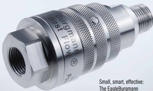
Small, smart, effective: The EagleBurgmann BestFlow®

Stora Enso, a world leading producer of pulp, paper, packaging boards and wood products run a sulphate mill in Skutskär, Sweden which was founded in 1894. Today the Skutskär mill has a workforce of about 385 people and produces on three production lines approx. 530,000 tons bleached pulp used for paper pulp and fluff pulp. The production is first class, which meets very high standards concerning environmental protection and quality requirements.